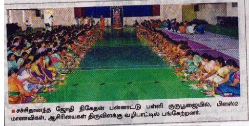
சச்சிதானந்த ஜோதி நிகேதன் பன்னாட்டு பள்ளி குழுக்களில், பிளஸ்2 மாணவிகள், ஆசிரியைகள் திருவிளக்கு வழிபாட்டில் பங்கேற்றனர்.